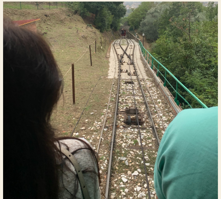
Figure 4: The view down the Montecatini Funicular. The view from every window is amazing.