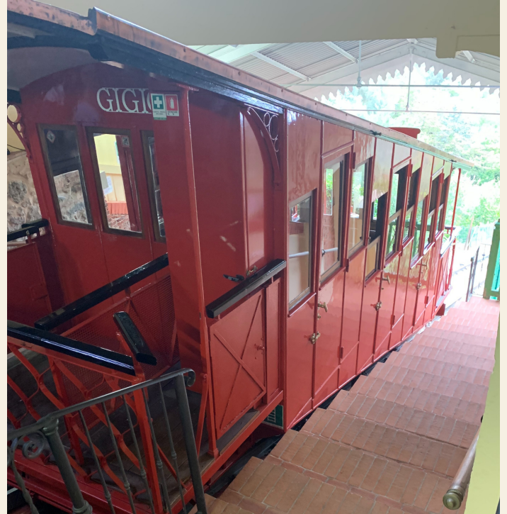
Figure 3: A car of the Montecatini Funicular showing the stepped construction of the car.

most, if not all, have been upgraded with modern controls and braking and safety systems. Funiculars provide safe and reliable access to amazing mountaintop sites with a touch of adventure and amazing views. If you get the chance, ride one.