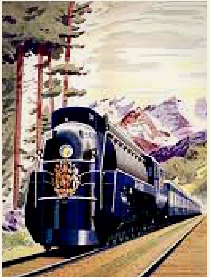
Figure 1: 1939 Royal Train on CNR tracks behind passenger locomotive Number 6400

The decision to rely on a single engine was brave and demonstrated careful planning, world class servicing and maintenance and supreme confidence in the engine's reliability. The King, a railway enthusiast, was impressed by the performance and subsequently granted permission for Canadian Pacific to mount crowns on all members of the engine class and designate them Royal Hudson - the only instance of "Royal" status being