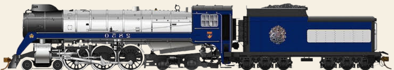
Figure 4: CPR locomotive Number 2850 in its Royal Train color scheme.

After crossing (and recrossing) Canada, the tour descended into the United States with visits to Washington, D.C., New York City, the New York World's Fair and a relaxing day at President Franklin Roosevelt's country estate at Hyde Park on the Hudson River - where guests were treated to a picnic of hot dogs and smoked turkey sandwiches. The train re-entered Canada and journeyed through the Maritimes and Newfoundland. The visit ended as it had begun - on a Canadian Pacific ocean liner. The King and Queen left Halifax on June 17th aboard RMS Empress of Britain, escorted by ships of the Royal Navy and the Royal Canadian Navy. The massive job was done. 75 days later, World War Two began.