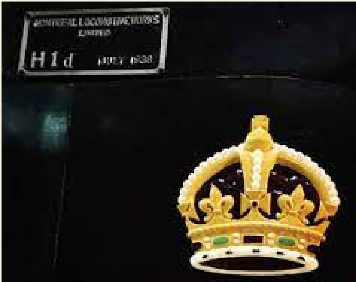
Figure 3: Painted cast brass crowns as mounted on the running boards of CPR "Royal Hudson" passenger locomotives.

crowns while Figure 4 is a color profile drawing of 2850 in its Royal Train color scheme.