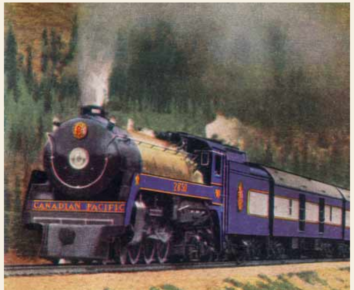
Figure 2: 1939 Royal Train on CPR tracks behind passenger locomotive Number 2850

granted outside of England. All forty-five members of the class carried this honor for the rest of their service lives. Figure 3 is a close-up of one of the